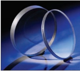
KiloLambda nanostructure based optical fuse and limiter, for laser protection and power control.

blood testing. Military (15%); where IAI, Elbit systems, Rafael and SCD develop and manufacture lasers, night-vision and remote sensing systems. Optical communication (8%); where Sivcom and Color-chip develop transmitters and receivers, Red-C amplifiers, KiloLambda power control and ECI systems. Material processing (4%); metals, ceramics and especially diamonds. Commercial space and optical remote sensing (<1%); IAI-EROS satellites. Nanotechnology (<1%); conductive coatings for solar panels, KiloLambda nonlinear filters.