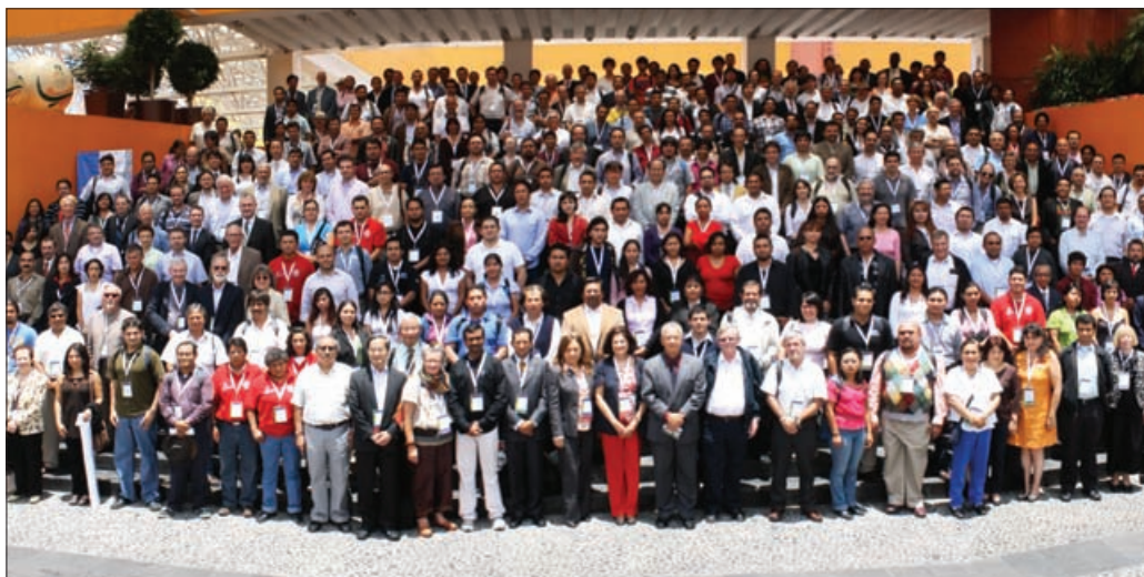
Participants of the ICO-22 General Congress that took place in Puebla, Mexico on 15–19 August.

The 22nd Congress of the International Commission for Optics proved to be a great success.