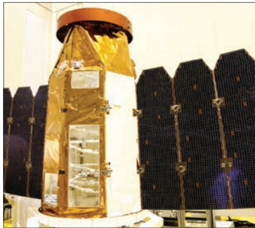
IAI satellite with a space camera – the largest camera made in Israel.

Early starts, present activity and future programmes.