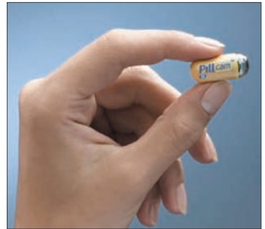
Given Imaging Pill-cam, the smallest camera (you can swallow it) made in Israel.